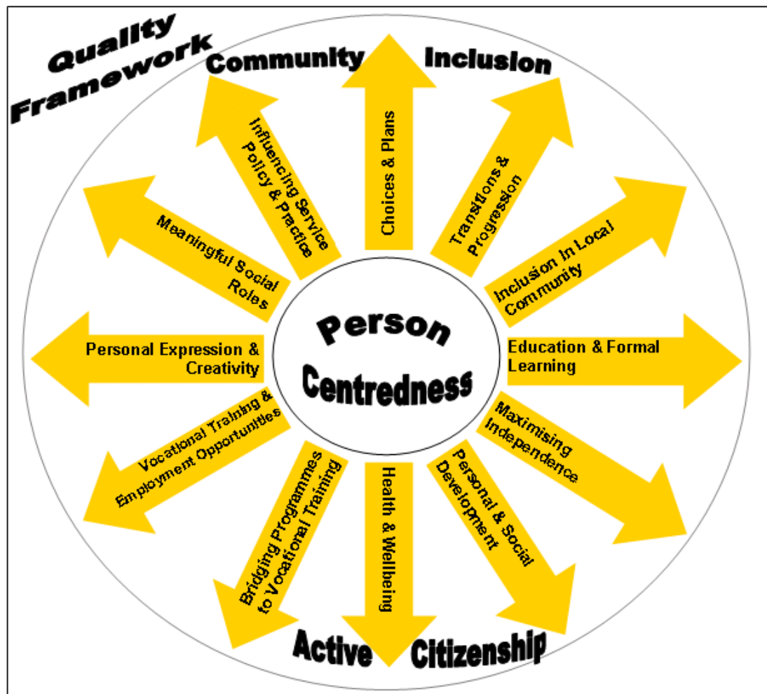
Figure 1. Illustration of the 12 Supports from New Directions, Review of HSE Day Services and Implementation plan 2012-2016