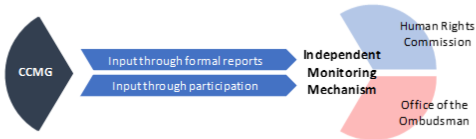
Figure 2: Channels for CCMG input into the IMM.

The CCMG provides a point for persons with disabilities to participate in the monitoring process. It coordinates an ethical mechanism for collecting the input of persons with disabilities to monitor disability rights. The approach comprises a